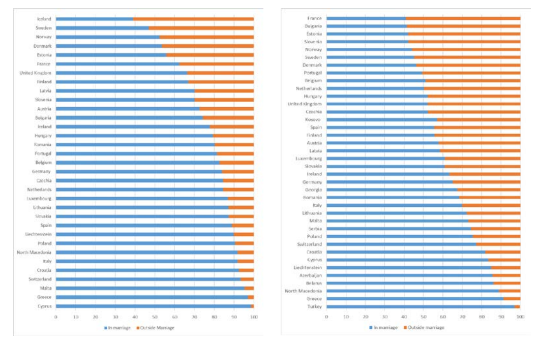
Fig.1 - Births outside and inside marriage across EU Member States - % (1995 and 2015)

Netherlands (+35%), Spain (+33%), Portugal (+32%), Bulgaria (+32%), Belgium (+31%), Germany (+28%), Slovakia (+27%), France (+22%), Italy (+22%), Poland (+16%), United Kingdom (+14%), Ireland (+14%) and, finally, Estonia (+11%).